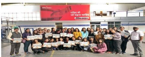
Industrial visit: Dainik Bhaskar