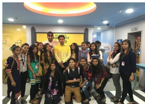
Industrial visit: Radio City, Mumbai