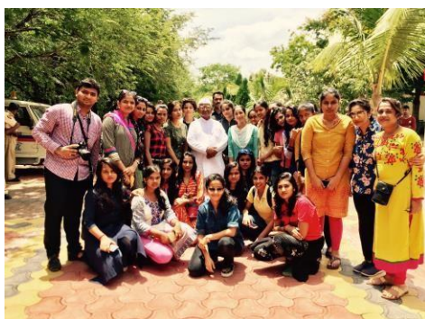
Industrial visit: Ralegan Siddhi