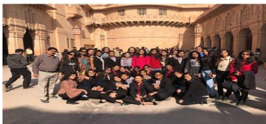
Industrial visit: Rajasthan