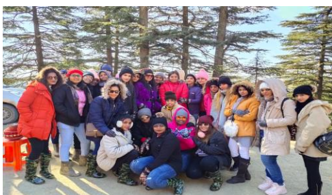
Industrial visit: Shimla