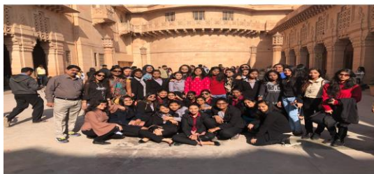
Industrial visit: Rajasthan