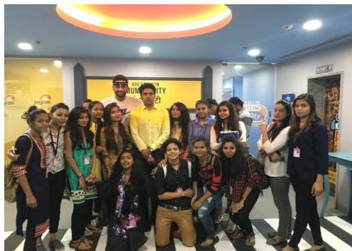
Industrial visit: Radio City, Mumbai