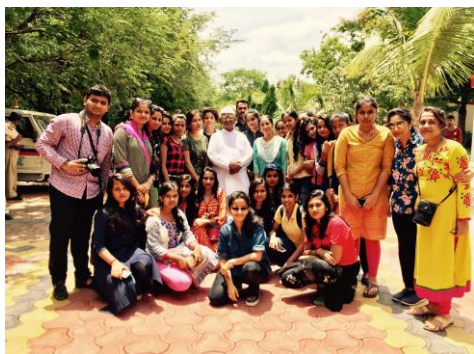
Industrial visit: Ralegan Siddhi