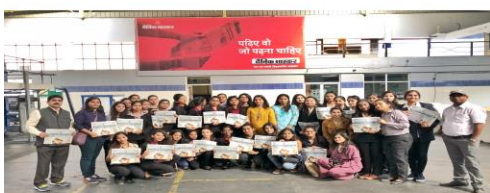
Industrial visit: Dainik Bhaskar